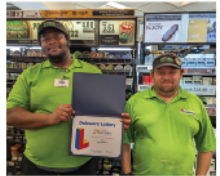
20 YEARS ROYAL FARMS #119