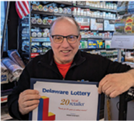
20 YEARS SHORE STOP #271