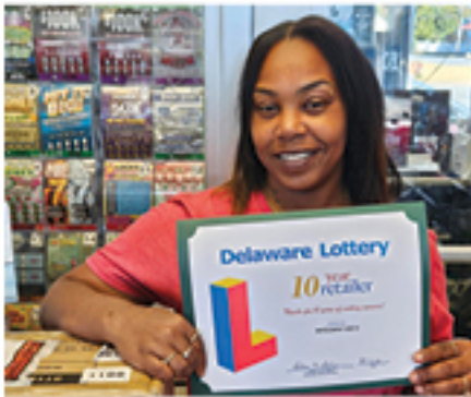
10 YEARS SPEEDWAY #2812