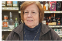
SHARON $50 COASTAL WINE & SPIRITS