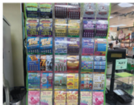
SHAWNEE COUNTRY STORE