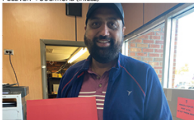
40 YEARS 7-ELEVEN - BEAR (#16354)