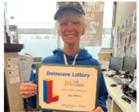
10 YEARS ROYAL FARMS #176