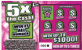
5X THE CASH (458)