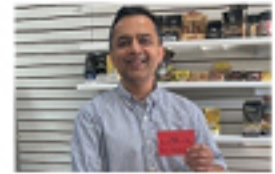
SENEHAL $50 SUNSET DELI & MKT