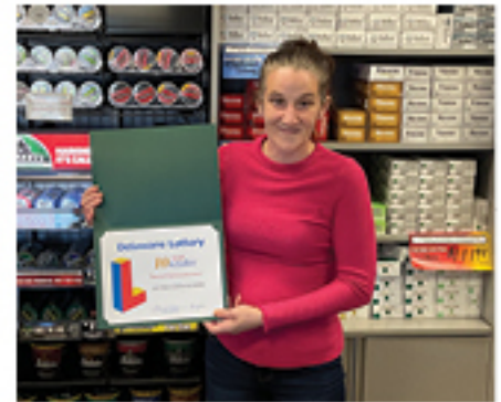
10 YEARS JOE'S TOBACCO SUPERSTORE