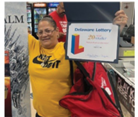
20 YEARS TOBACCO TIME