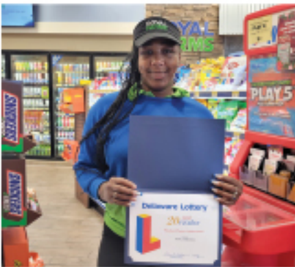
20 YEARS ROYAL FARMS #109