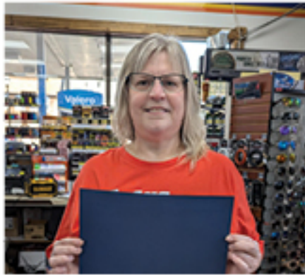
20 YEARS SHORE STOP #277