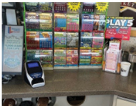
NORTH DOVERTIGER MART