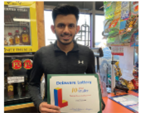
10 YEARS O'NEILL'S LIQUORS