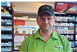
WILFRED $50 ROYAL FARMS SOUTH DOVER