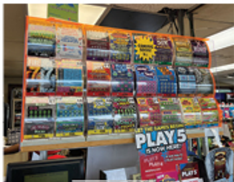
SHORE STOP RODNEY VILLAGE