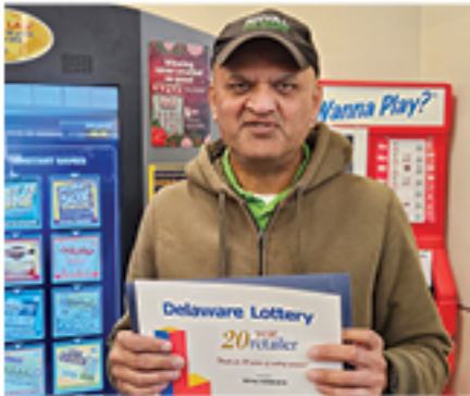
20 YEARS ROYAL FARMS #316