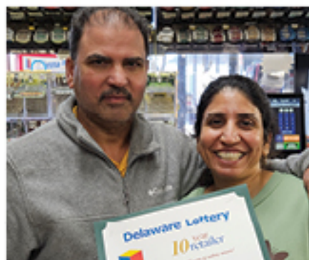
10 YEARS MARKET PLACE