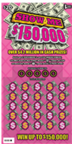
SHOW ME $150K (455)