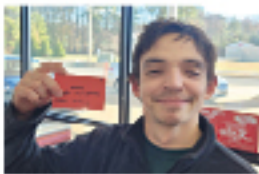
MIKE $100 HIGHS WOODSIDE