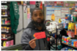
HAKHEEM $50 BEAR SHELL