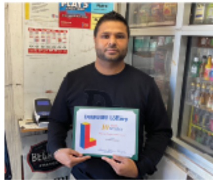
10 YEARS HI SPIRITS LIQUORS