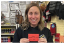
MEGAN $50 DELAWARE CITY CITGO