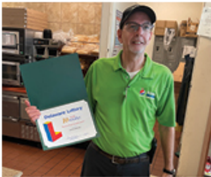
10 YEARS ROYAL FARMS #196