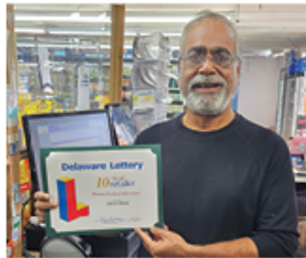
10 YEARS ROUTE 8 LIQUORS