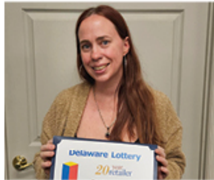
20 YEARS UNITED CHECK CASHING