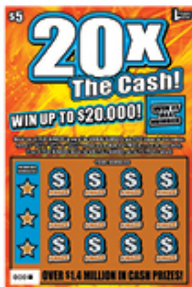
20X THE CASH (460)