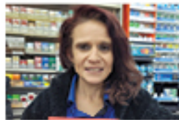
SABRINA $100 SHORE STOP RISING SUN