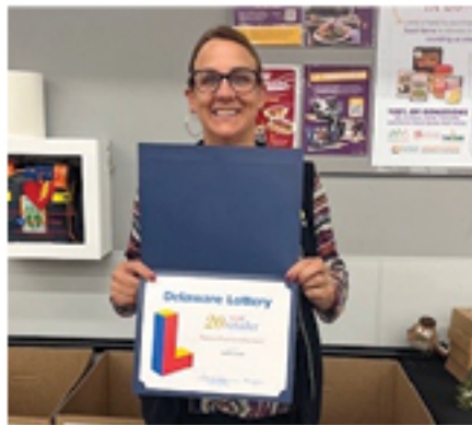
20 YEARS SUPER G #388