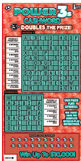
POWER 3x CASHWORD (457)