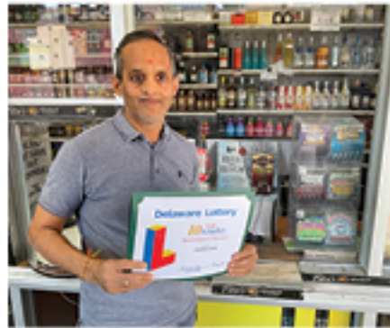
10 YEARS FRANKLIN LIQUORS