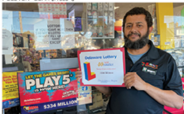
40 YEARS 7-ELEVEN - MARYLAND AVE (#11305)