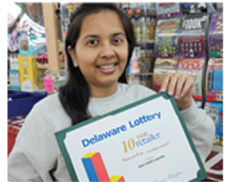
10 YEARS EAST COAST LIQUORS