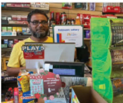
10 YEARS LIBERTY FOOD MARKET