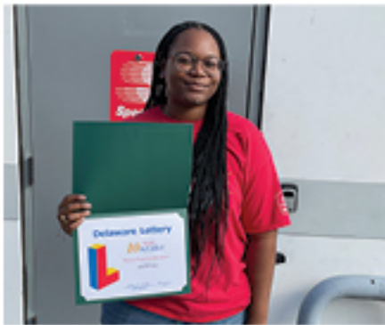
10 YEARS SPEEDWAY #2813