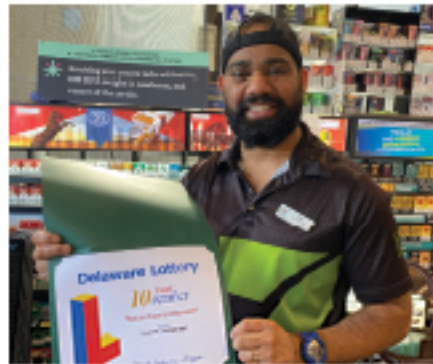
10 YEARS 7-ELEVEN-DUPONT HWY. #36876H