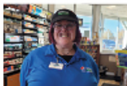
RAKEDA $500 ROYAL FARMS 151 W. DOVER