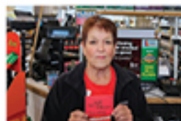
LINDA $500 SHORE 5 TOP - GREENWOOD