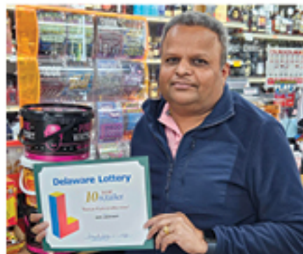
10 YEARS KENT LIQUOR MART