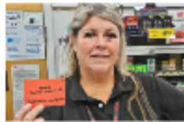
DAWN $50 ACME REHOBOTH