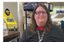
BRYNN $250 ACME MARKETS FOX RUN