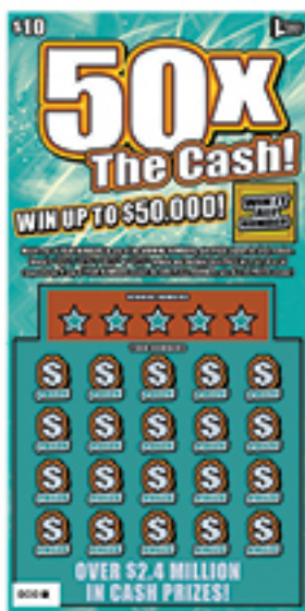
50X THE CASH (461)