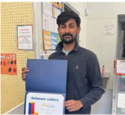
20 YEARS DELAWARE CITY CITGO