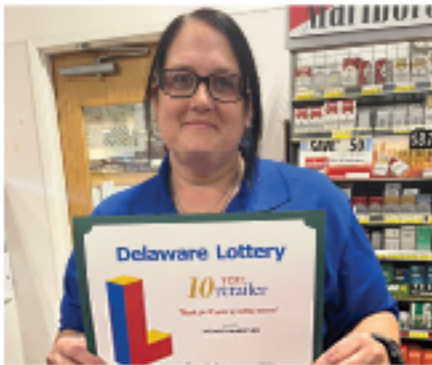
10 YEARS REDNER'S MARKET #18