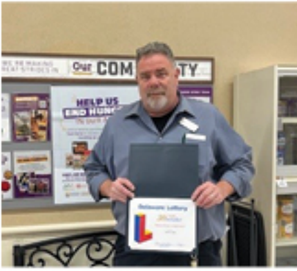
30 YEARS SUPER G #385