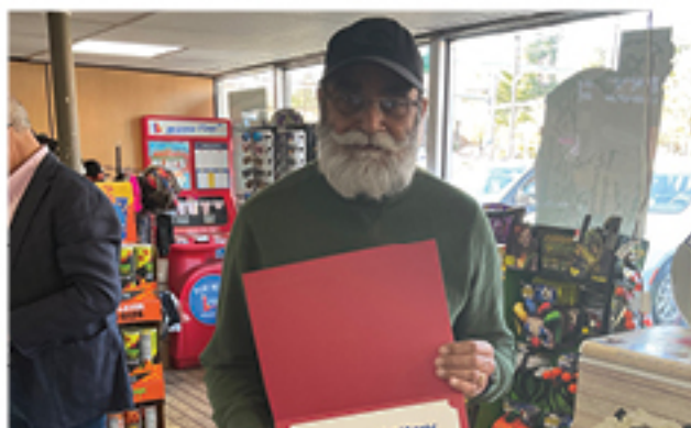
40 YEARS 7-ELEVEN - FOULK ROAD (#11282)