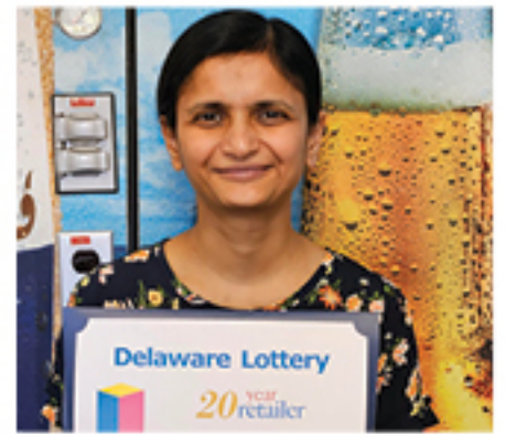
20 YEARS EASTSIDE PACKAGE