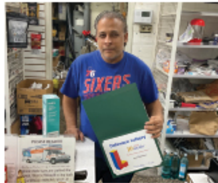
10 YEARS EXPRES 5 FOOD MARKET