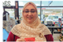
SIBGHA $50 7EVEEN SEAFORD