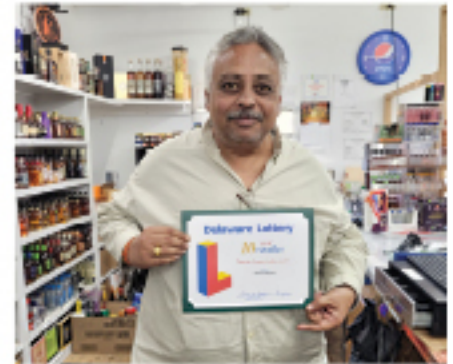
10 YEARS GEO'S LIQUORS