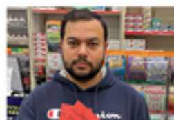
SAHIL $500/$250 BOXWOOD BOOKS & TOBACCO