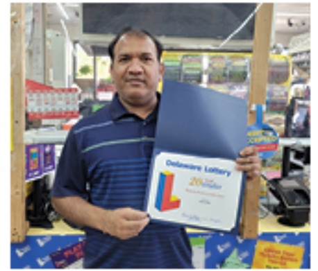
20 YEARS FIRST STOP