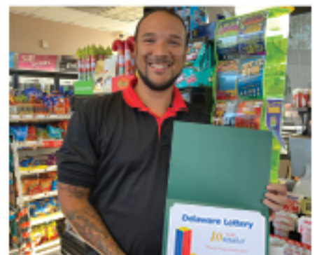
10 YEARS SPEEDWAY #2814