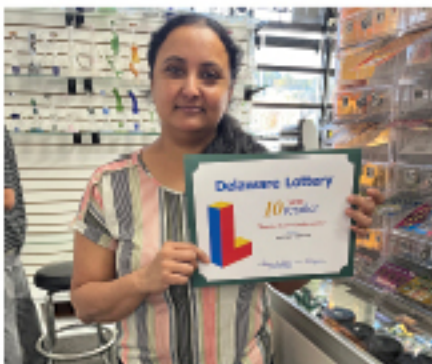
10 YEARS BACK BAY TOBACCO