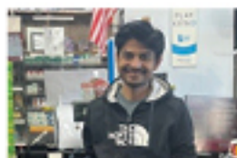
FALGUN $500 CONTINENTAL LIQUOR