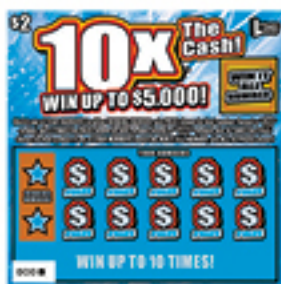
10X THE CASH (459)