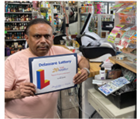
20 YEARS SILVIEW LIQUORS