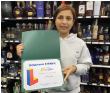
10 YEARS UNIVERSAL LIQUORS