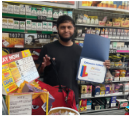
20 YEARS COUNTRY TOBACCO